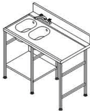
Double Bowl Sink Unit - Left Hand