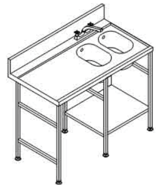
Double Bowl Sink Unit - Right Hand